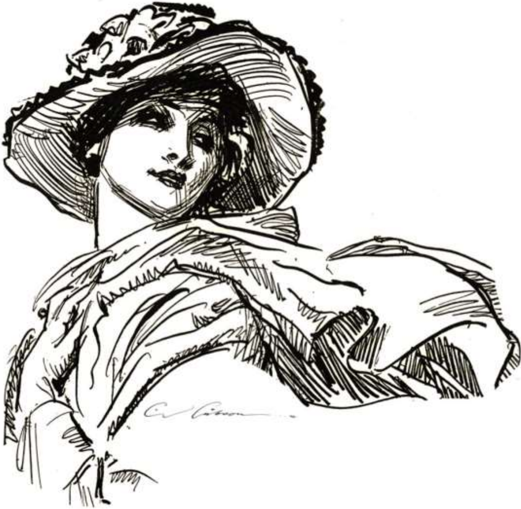
Charles Dana Gibson (1867-1944)