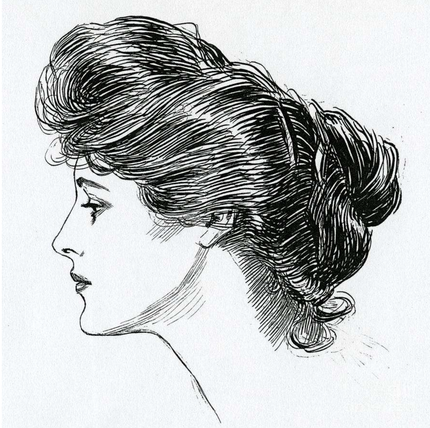
Charles Dana Gibson (1867-1944)