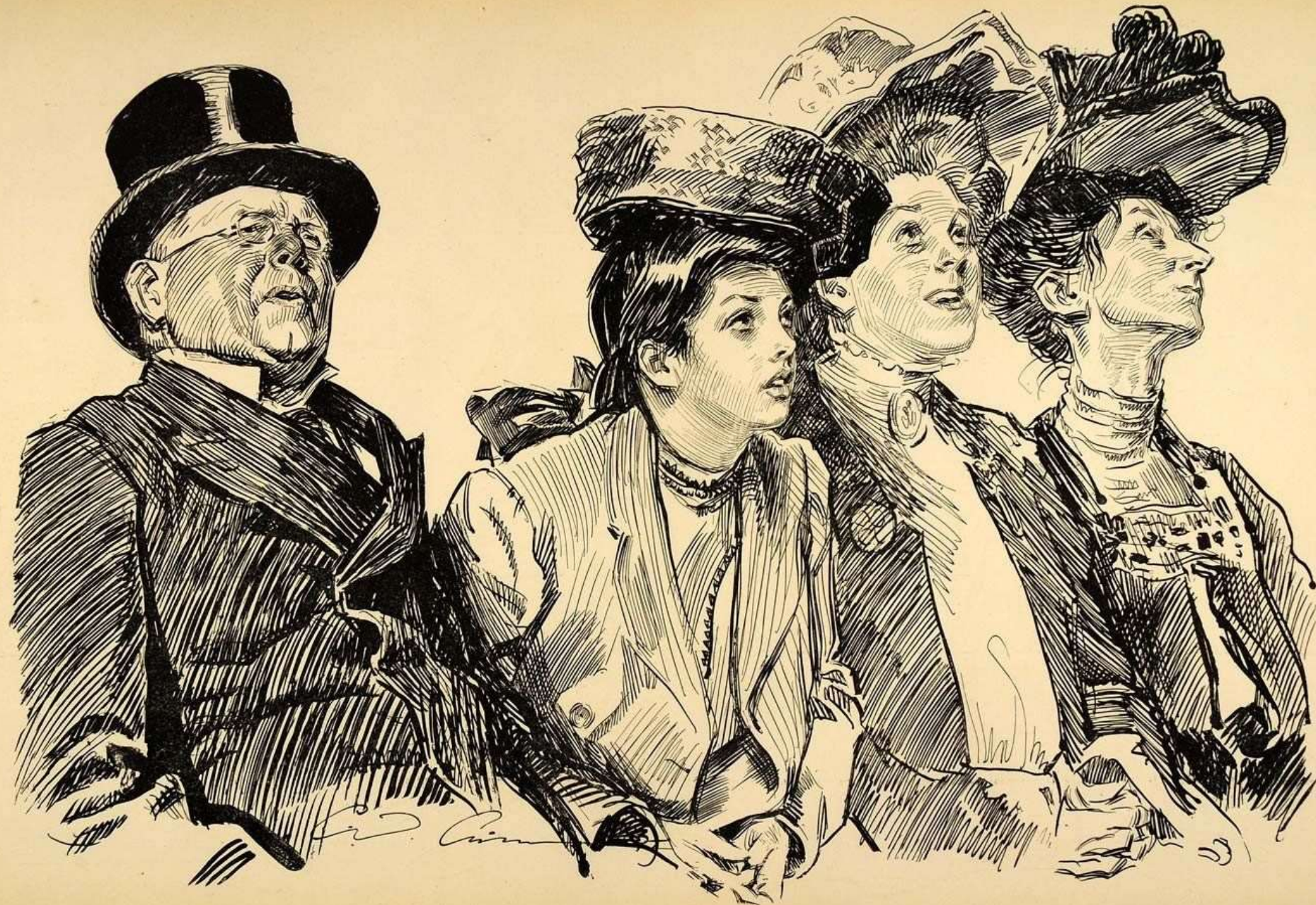
Charles Dana Gibson (1867-1944)