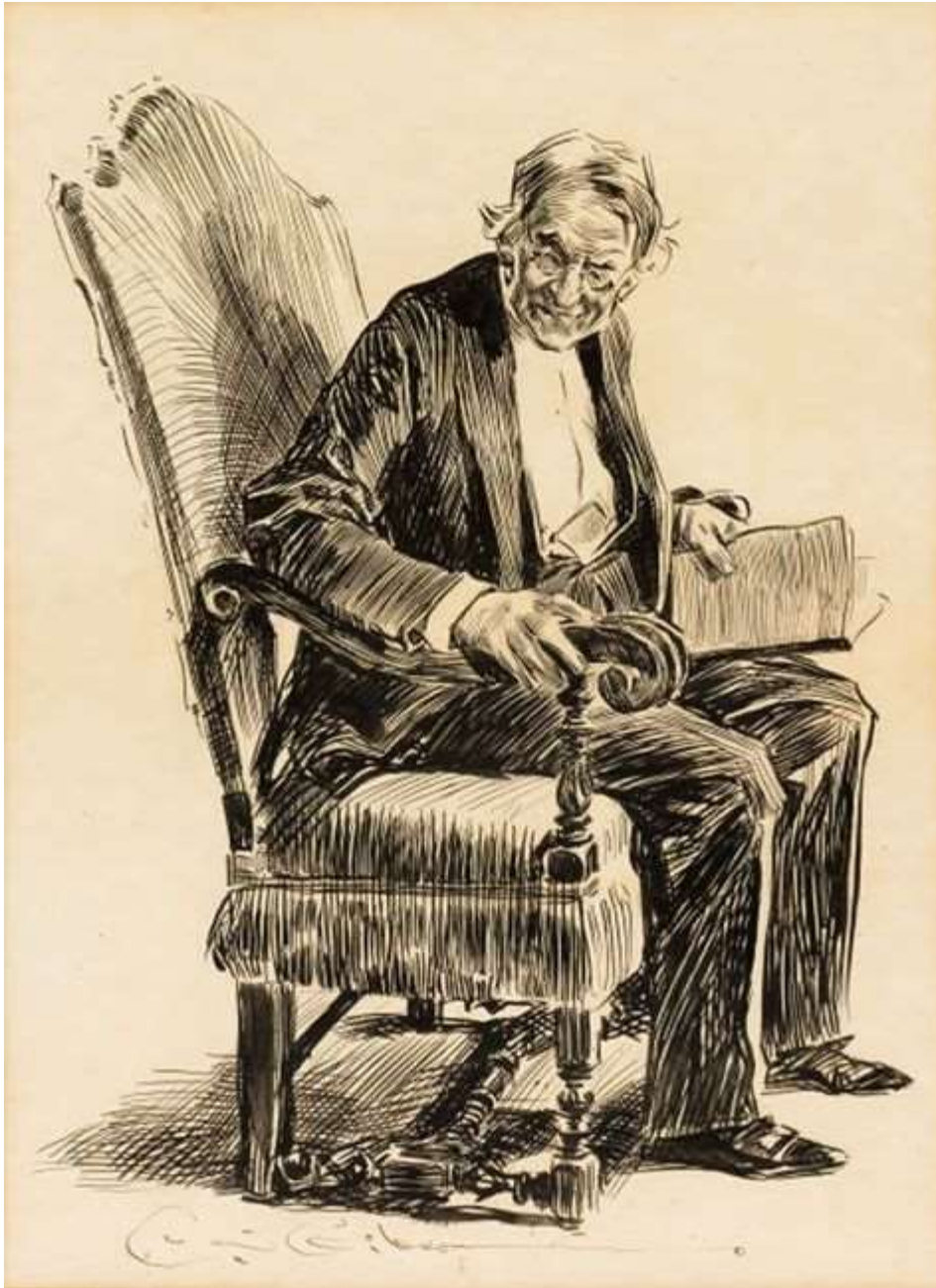
Charles Dana Gibson (1867-1944)