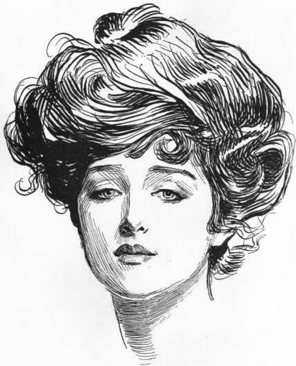
Charles Dana Gibson (1867-1944)